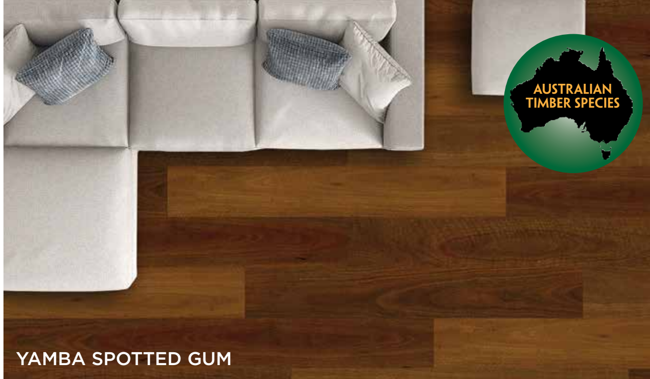
YAMBA SPOTTED GUM