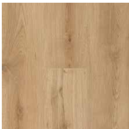
VALENCIA OAK 13