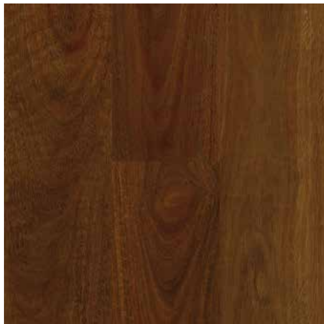
YAMBA SPOTTED GUM