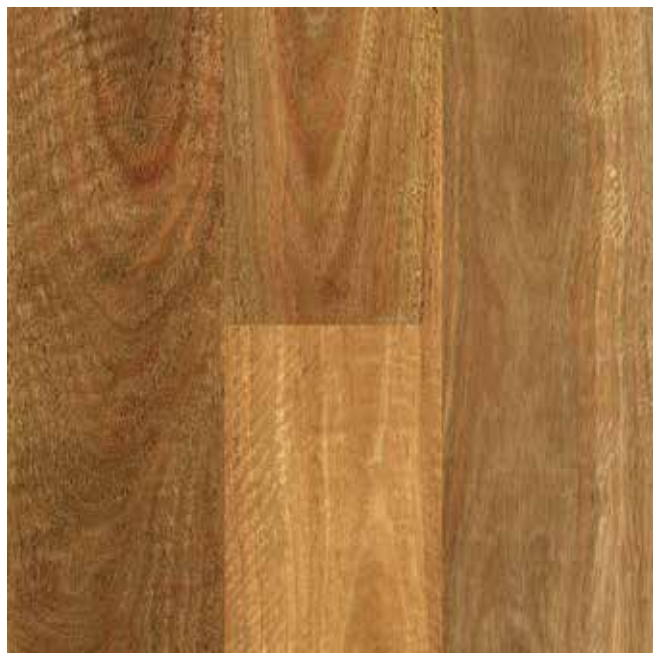
BURLEIGH HEADS SPOTTED GUM