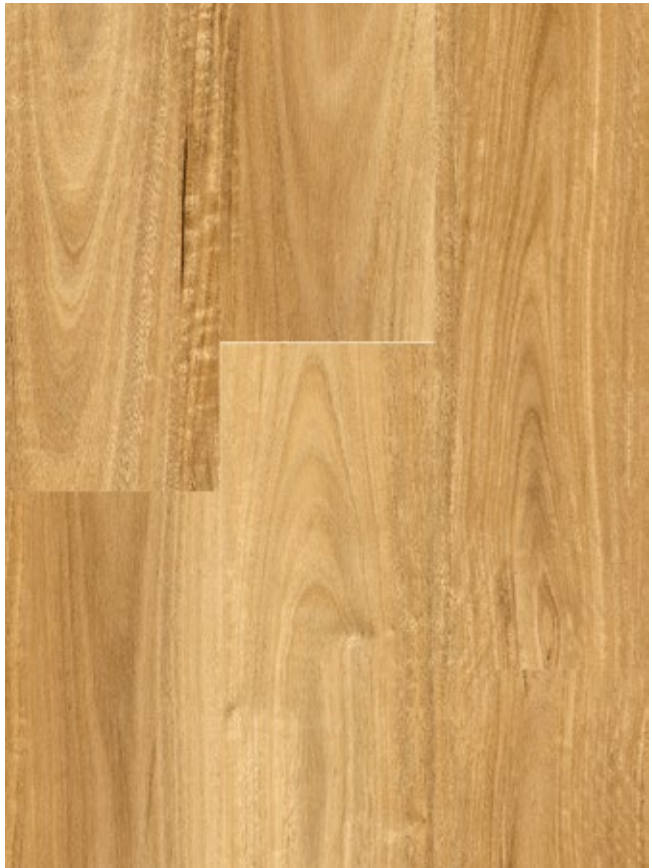
BOWRAL SPOTTED GUM