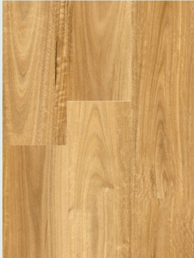
Bowral Spotted Gum