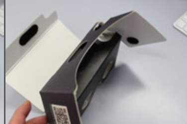
Fold back on itself using the velcro