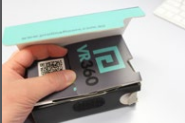
Open VR lid