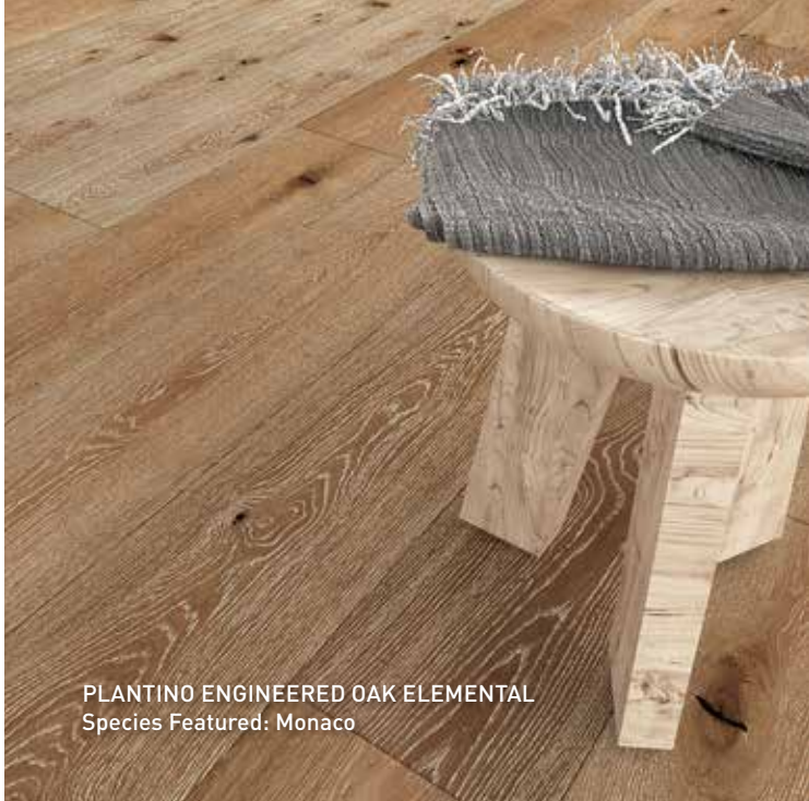
PLANTINO ENGINEERED OAK ELEMENTAL Species Featured: Monaco

Featuring distinctive natural grains, our Plantino Engineered Oak Elemental brings timeless character to any space.